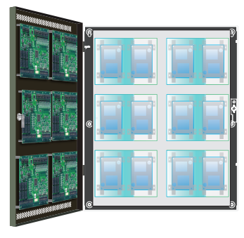
E4M1 EXPANDS SIX MR52 TO DOOR